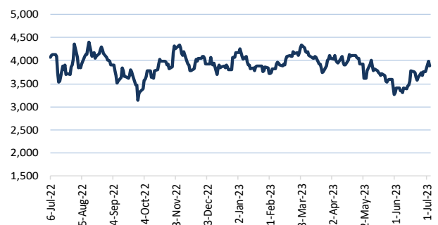
CPO: Bursa Malaysia Crude Palm Oil (MYR/MT)