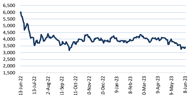
CPO: Bursa Malaysia Crude Palm Oil (MYR/MT)