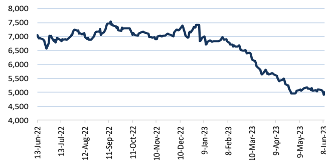
Pulp: Generic Bleached Softwood Craft Pulp (CNY/MT)