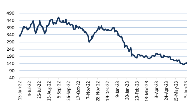
Coal: Newcastle Coal (USD/MT)