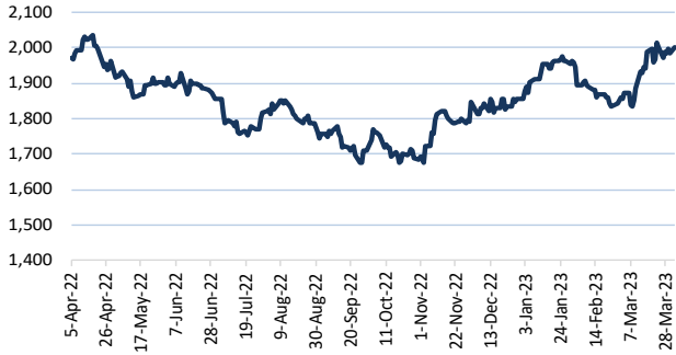
Gold: Gold 100 Oz Futures (USD/Troi oz)