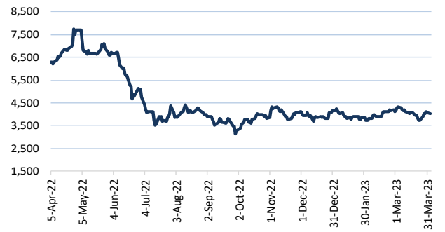
CPO: Bursa Malaysia Crude Palm Oil (MYR/MT)