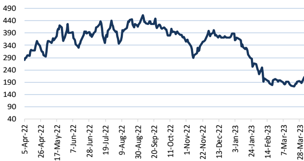
Coal: Newcastle Coal (USD/MT)