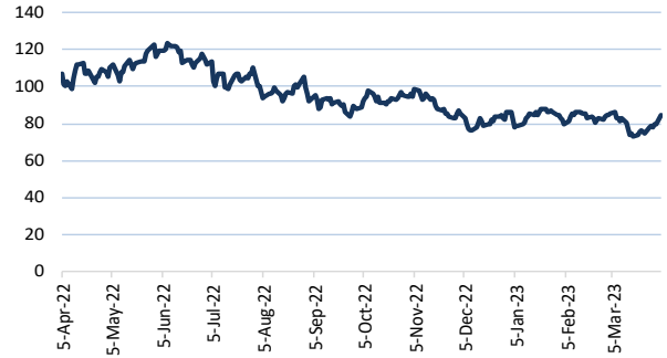
Oil: Generic 1st Crude Oil, Brent (USD/Barel)