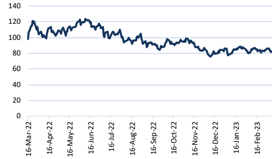
Oil: Generic 1st Crude Oil, Brent (USD/Barel)