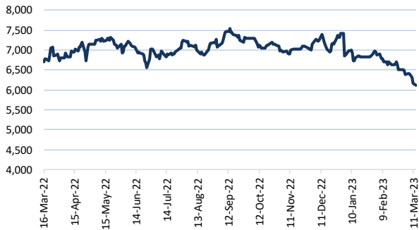
Pulp: Generic Bleached Softwood Craft Pulp (CNY/MT)