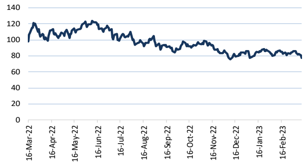
Oil: Generic 1st Crude Oil, Brent (USD/Barel)